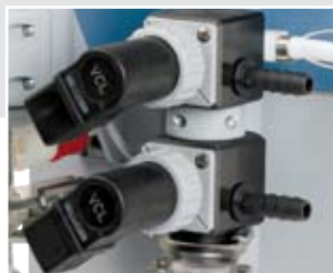
PC 520 NT with two CVC 3000